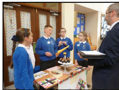
Discussion with one of the judges during the trade fair.