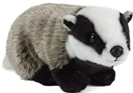
WINNER - Nightingale