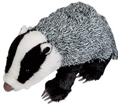
WINNER - Attenborough